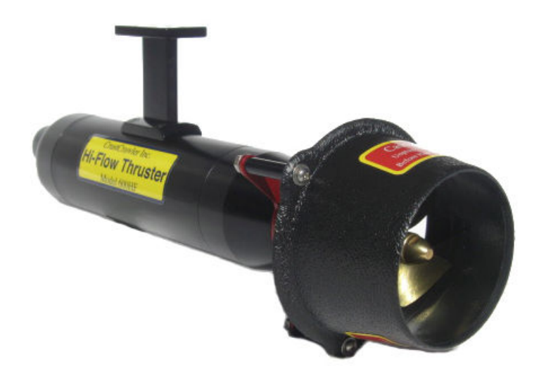
Figure 1 - 600HF Thruster with Mounting Bracket